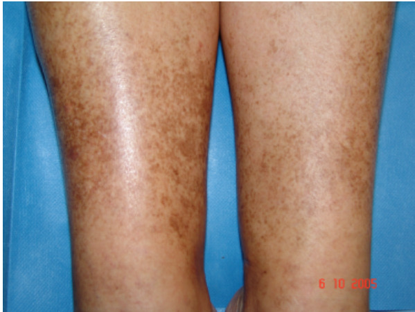
Figure 1. Purpuric macules and patches, ochre-brownish in color, on the lower third of both legs with no discomfort except her aesthetic problem.

when used for the treatment of pigmentary lesions. 4 A pigmentary ochre dermatitis secondary to a chronic venous insufficiency causes important cosmetic disturbances, and no therapeutic options have been proposed that can guarantee good cosmetic results.